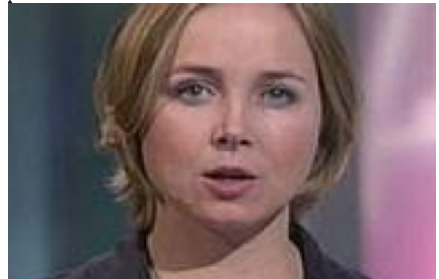
Katie Razzall presenting the Channel 4 News!

Katie Razzall will assist with media and communication, she is one of Channel 4's news presenters.